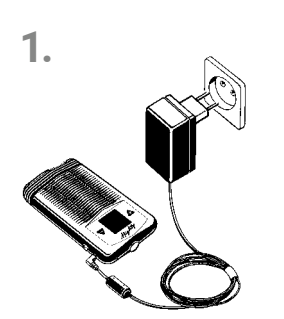
Charge Vaporizer before use.